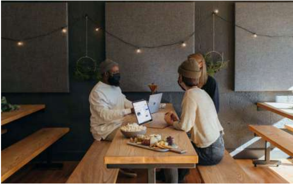
People Development & Employee Engagement