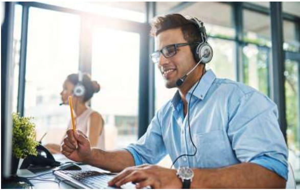
Concierge Service Delivery & Operations