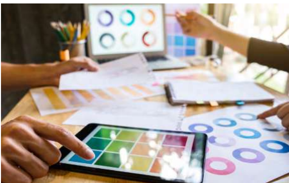
Branding & Graphic Design