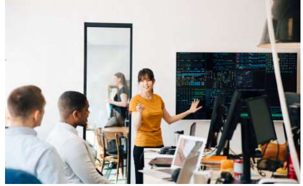
Corporate Client Services