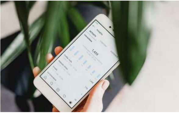
Marketing & Data Insights