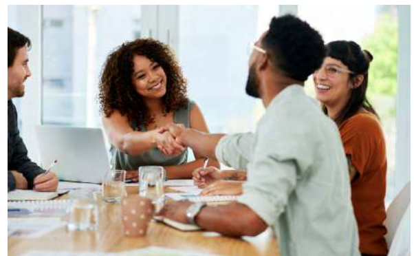
Customer Experience & Member Satisfaction